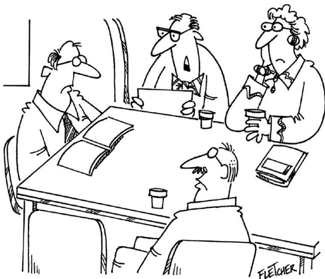
More at LeadershipJournal.net/Cartoons