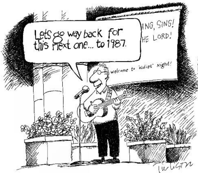
"Oldies Night" at the contemporary church.