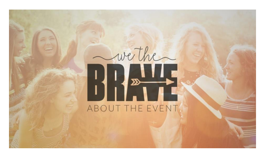
"WE THE BRAVE" SEPTEMBER 10, 2016

"We The Brave" is an evening event for women and girls, hosted in churches and homes across Canada. This is not Your average women's event! Prepare to be inspired, uplifted and encouraged by hope-filled songs and stories, laughter and community. In an intimate setting, we'll discover together as women what it really means to be brave and how we can live authentically, fully and without fear. We'll hope and we'll dream and we'll learn the art of brave and the art of freedom. For girls and women, grade 7 and up. $25 which will include food and the evening event. Limited to 60 participants. Ticket sales ON NOW! You may purchase them before or after church from Brenda Stewardson or by contacting Pastor Chris on Facebook, email (corly@execulink.com) or phone (519-243-3862).