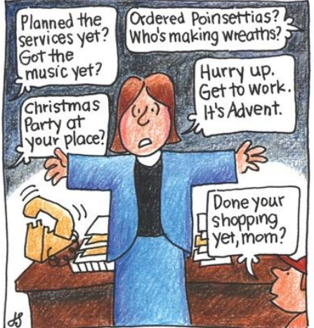
ONE MONDAY IN ADVENT