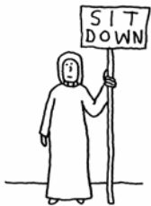
LOOK OUT FOR SUBTLE HINTS GIVEN BY THE CLERGY