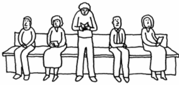
SEE WHETHER IT SAYS ANYTHING IN THE SERVICE BOOK